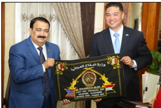
08 February 2017: His Excellency Erfan al-Hayli, Iraqi Minister of Defense

Baghdad Iraq: During the height of ISIS's invasion into Iraq in 2016, I served as the U.S. Ambassador's Senior Advisor to Iraq's Minister and Chief of Defense. In Iraq's tribal society, trust isn't given—it's earned through shared experience, respect, and humility.