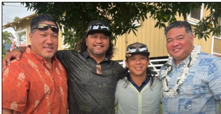
Our Kuleana, Our Time

Our value lies in trust—the trust we build with warfighters, the trust we foster across oceans, and the trust we uphold with our own people.