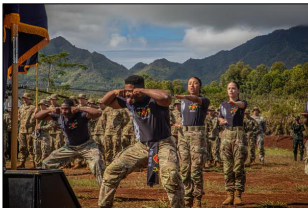
Modern Hawaii: 25 th Infantry Division, rapid deployment and strength in the Pacific

Building Trust Across Oceans: In Ka'ū, when conflict arises, we turn to ho'oponopono — a sacred practice of reconciliation and healing. In Baghdad, ho'oponopono became my guide for building trust with the Iraqi military leadership. It wasn't about imposing our will, but about restoring balance, resolving tensions, and building lasting relationships.